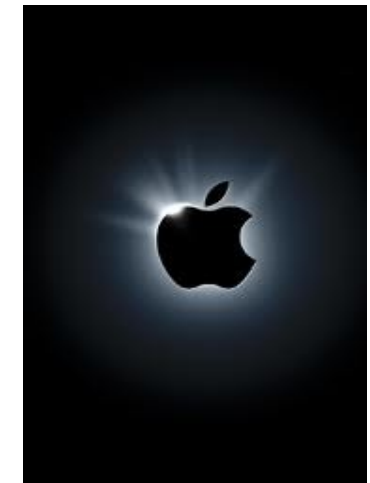
God, Lead us not into temptation, but deliver us from evil...

Many years ago, I attended a conference that challenged us to give up technology for a week or even a month. This was, of course, before the heyday of cell phones and Facebook. So I chose television. For one week, I avoided television with all my might, because it was still available to my husband.